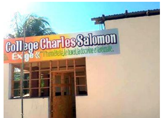
The same entrance after plastering and painting

Designated donations have been received to cover the cost of Oct. 6, 2018 earthquake repairs, which included minor damage to 2 walls and a cement block fence. There was no structural damage to the school.