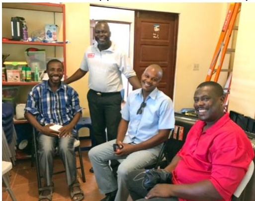
The APDD team meeting at the clinic

APDD, Croix-des-Bouquets based social justice organization partners with communities, like Dumay, to help fight crime and improve community safety. We support them by paying their yearly office rent. Consultation fees are paid for specialized patient care. Clothing and blankets are distributed to children in need. HAM pays school tuition for orphaned children in need. We support Haitian artists by purchasing their art for sale in the USA. "Days for Girls" menstruation supplies are distributed to young women in Dumay.