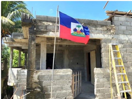
School entrance before plastering and painting