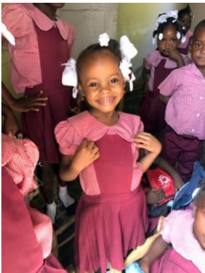
Primary school student

Major upgrades made to the school before the Oct. earthquake, with plastering and painting (seen here)