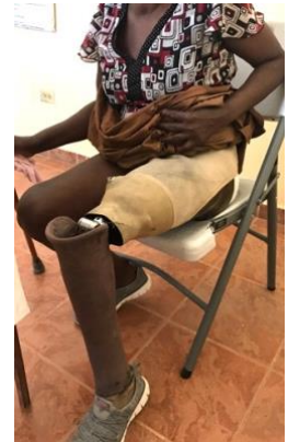
Patient in need of specialty consult for a new leg